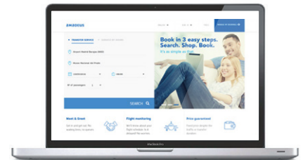
Amadeus Transfers Plug-& Play: a ready-made HTML with quick implementation

Traveller details and dates are automatically extracted from an existing flight booking and search fields are pre-populated in the Transfer booking tool. The booking is fully integrated into the PNR , which allows for simplified trip servicing and easy access to a transfer booking when needed.