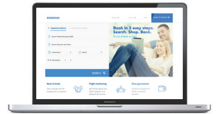
Amadeus Transfers Plug-& Play: a ready-made HTML with quick implementation

Traveller details and dates are automatically extracted from an existing flight booking and search fields are pre-populated in the Transfer booking tool. The booking is fully integrated into the PNR , which allows for simplified trip servicing and easy access to a transfer booking when needed.